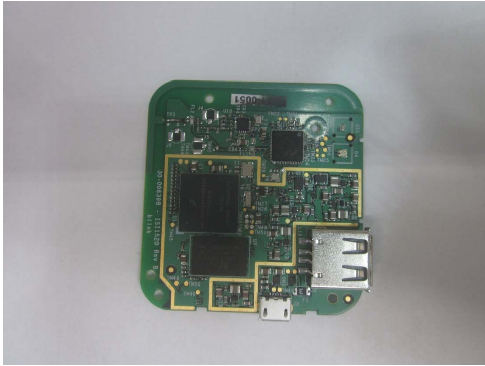
Board Top Side