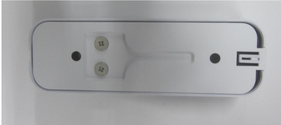
Rear of Enclosure