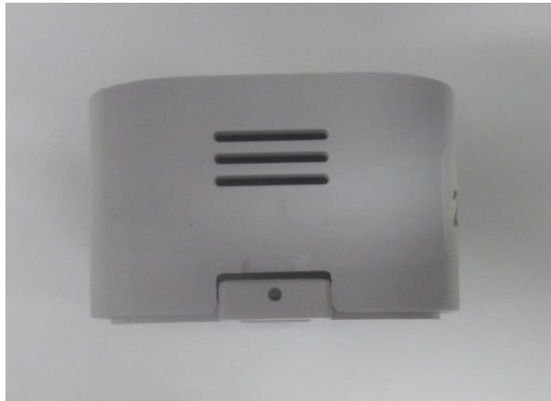
Bottom of Enclosure