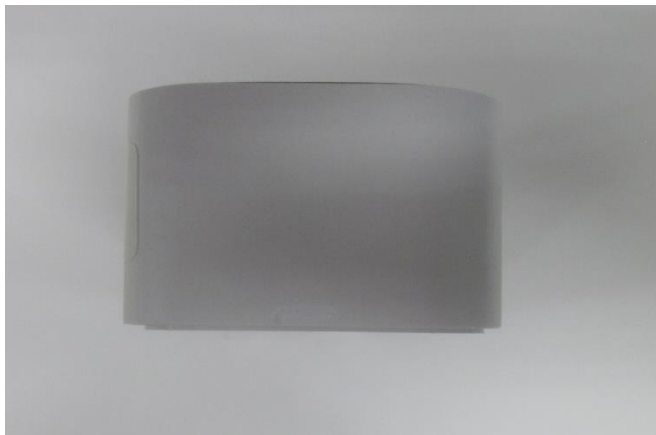
Top of Enclosure