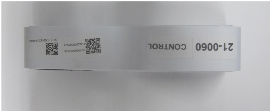
Left Side of Enclosure