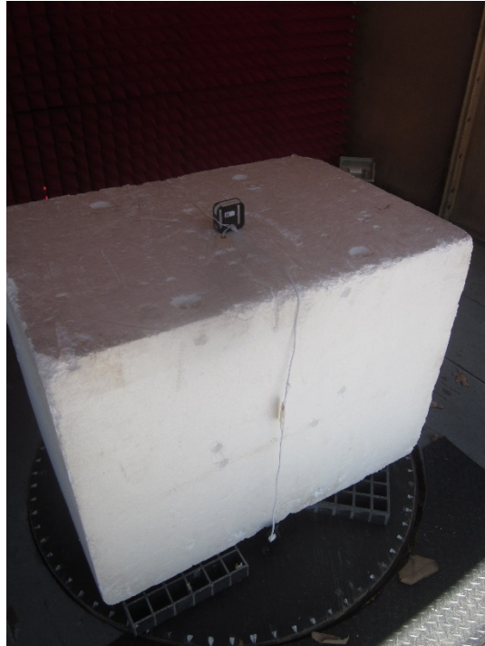
EUT Configuration, 80 cm