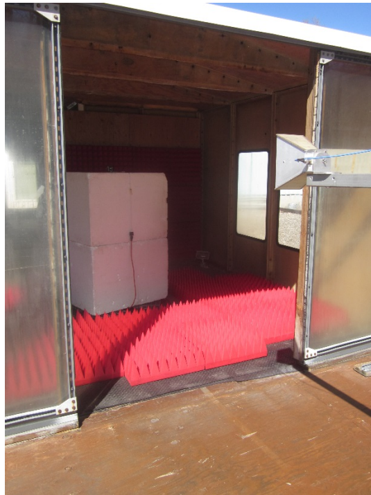
Horizontal Polarization, 1 to 18 GHz, Double Ridge Guide, 150 cm