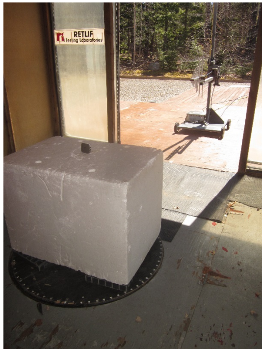
Vertical Polarization, 200 MHz to 1 GHz, Log Periodic, 80 cm