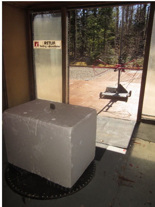
Horizontal Polarization, 30 to 200 MHz, Biconical Antenna, 80 cm