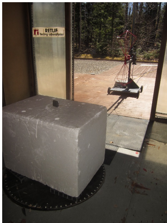
Vertical Polarization, 30 to 200 MHz, Biconical Antenna, 80 cm