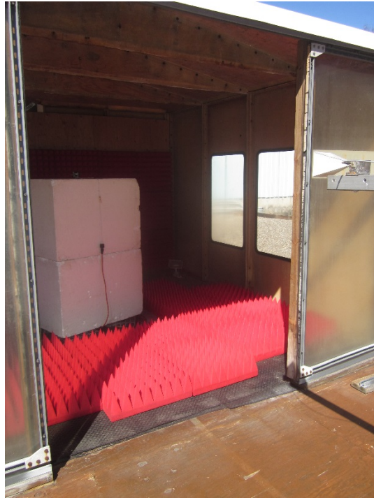
Horizontal Polarization, 18 to 25 GHz, High Gain Horn, 150 cm