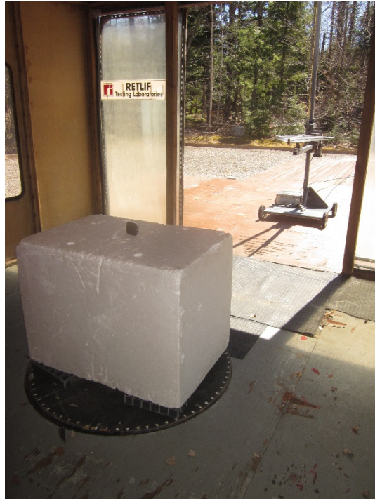
Horizontal Polarization, 200 MHz to 1 GHz, Log Periodic, 80 cm