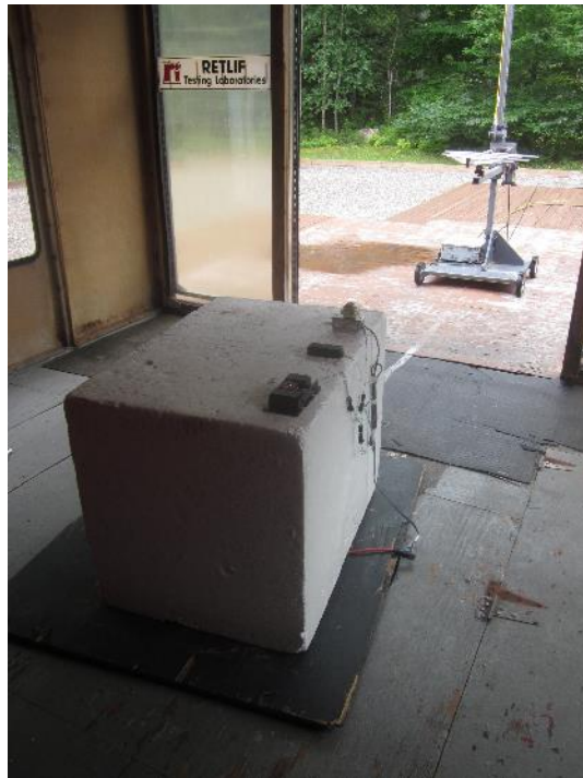
Horizontal Polarization, 200 MHz to 1 GHz, Log Periodic, 80 cm