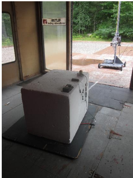
Vertical Polarization, 200 MHz to 1 GHz, Log Periodic, 80 cm