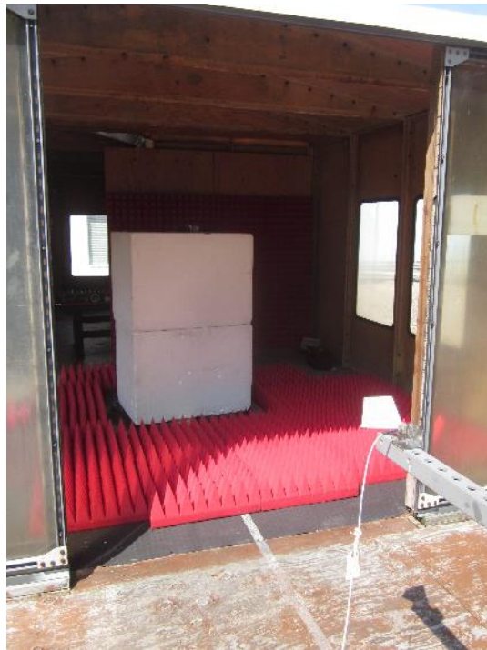
Horizontal Polarization, 18 to 25 GHz, High Gain Horn, 150 cm