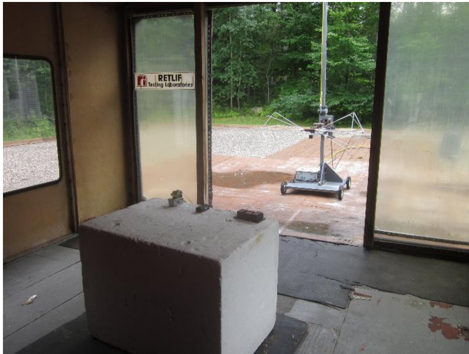
Horizontal Polarization, 30 to 200 MHz, Biconical Antenna, 80 cm