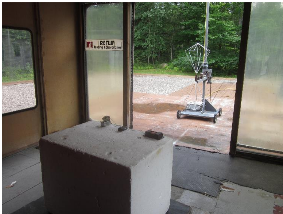
Vertical Polarization, 30 to 200 MHz, Biconical Antenna, 80 cm