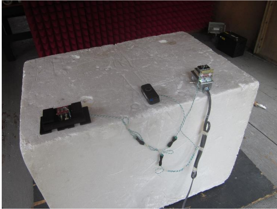
EUT Configuration, 80 cm