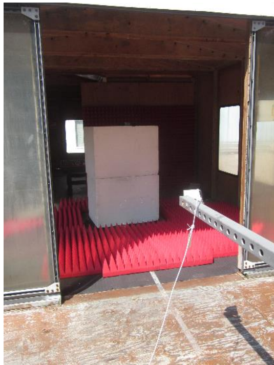
Vertical Polarization, 18 to 25 GHz, High Gain Horn, 150 cm