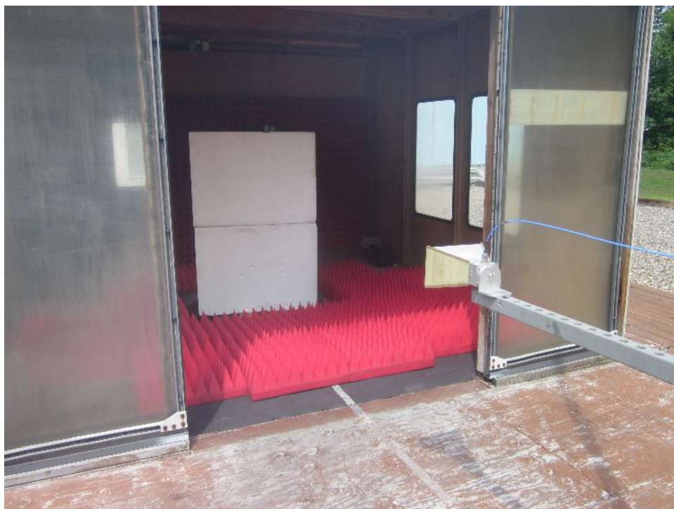
Vertical Polarization, 1 to 18 GHz, Double Ridge Guide, 150 cm