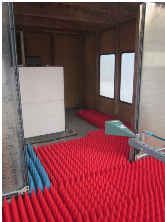
Vertical Polarization, 12- 18 GHz, High Gain Horn, 150 cm