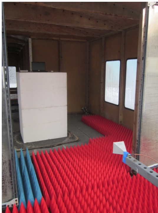
Vertical Polarization, 18 - 25 GHz, Standard Gain Horn, 150 cm