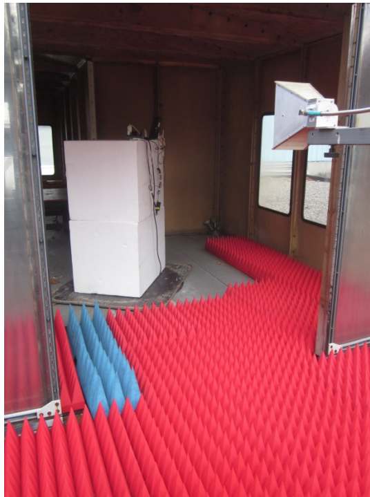
Horizontal Polarization, 1- 12 GHz, Double Ridge Guide, 150 cm