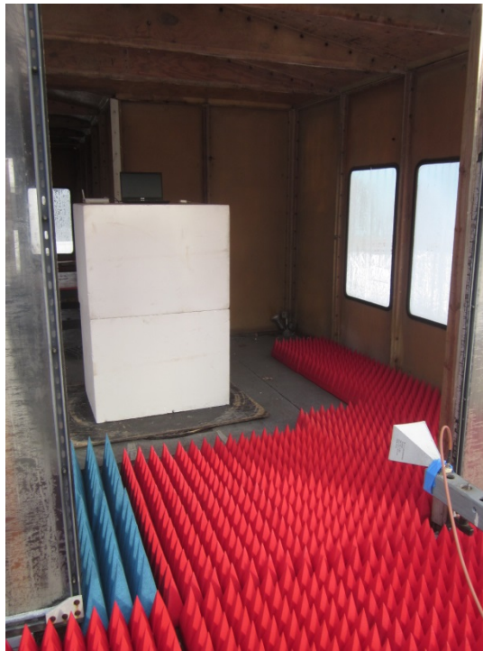
Horizontal Polarization, 18 - 25 GHz, Standard Gain Horn, 150 cm