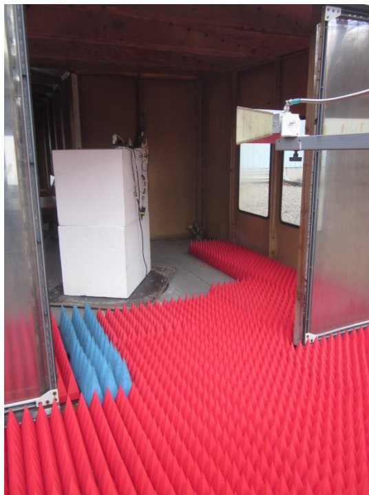
Vertical Polarization, 1- 12 GHz, Double Ridge Guide, 150 cm