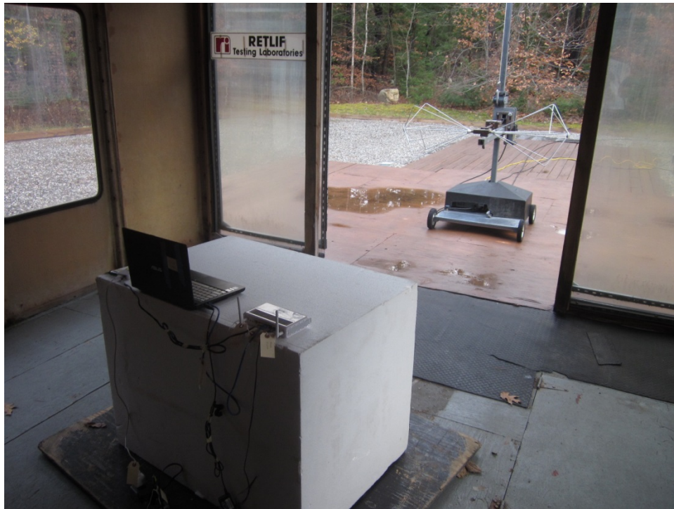
Horizontal Polarization, 30 MHz – 200 MHz, Biconical Antenna, 80 cm