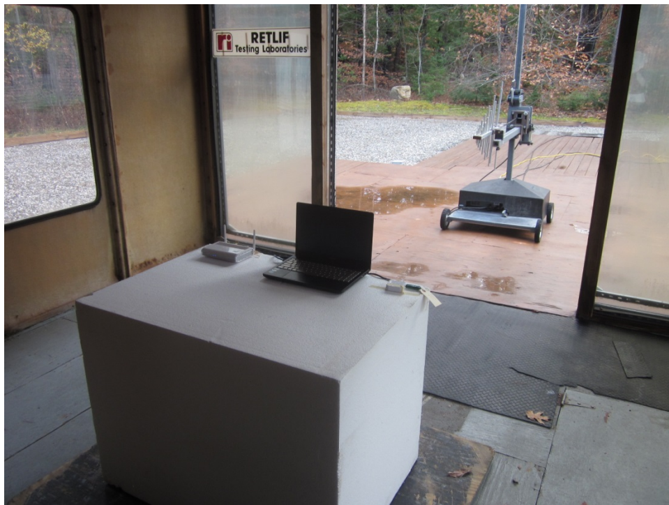
Vertical Polarization, 200 MHz - 1 GHz, Log Periodic, 80 cm