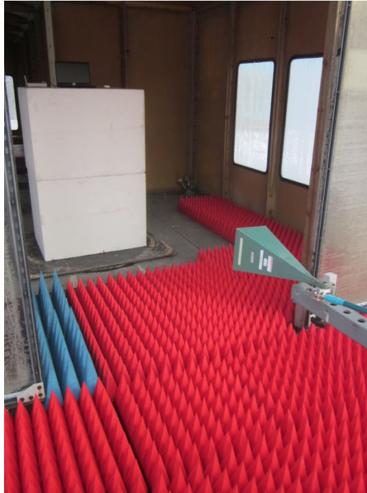
Horizontal Polarization, 12- 18 GHz, High Gain Horn, 150 cm