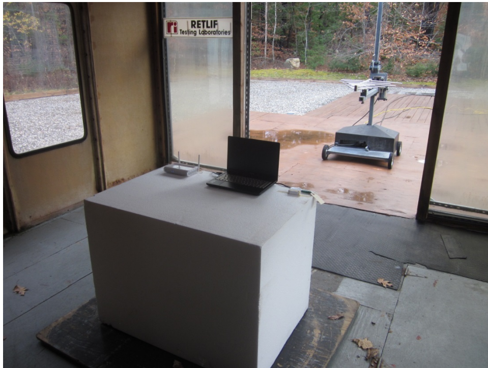
Horizontal Polarization, 200 MHz - 1 GHz, Log Periodic, 80 cm