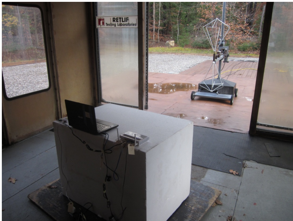
Vertical Polarization, 30 MHz – 200 MHz, Biconical Antenna, 80 cm