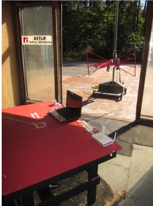
Horizontal Antenna Polarization, 25 MHz – 1 GHz