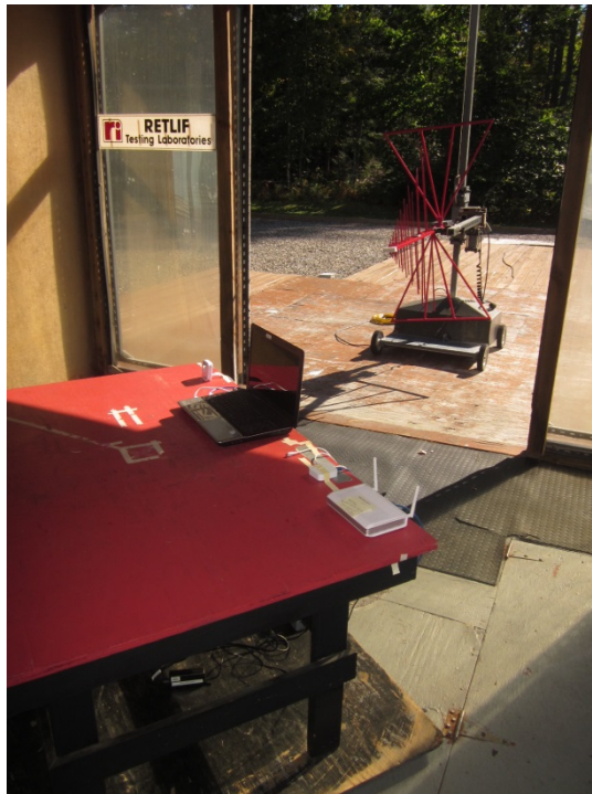
Vertical Antenna Polarization, 25 MHz – 1 GHz