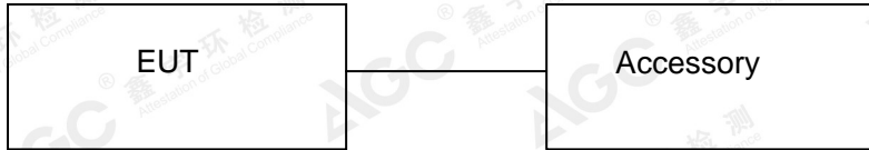
Table 2-1 Equipment Used in EUT System