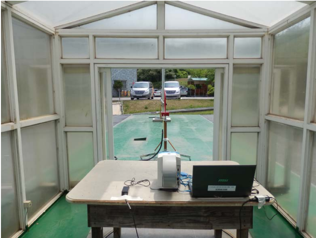
Photograph 1: Test Setup for Below 30 MHz