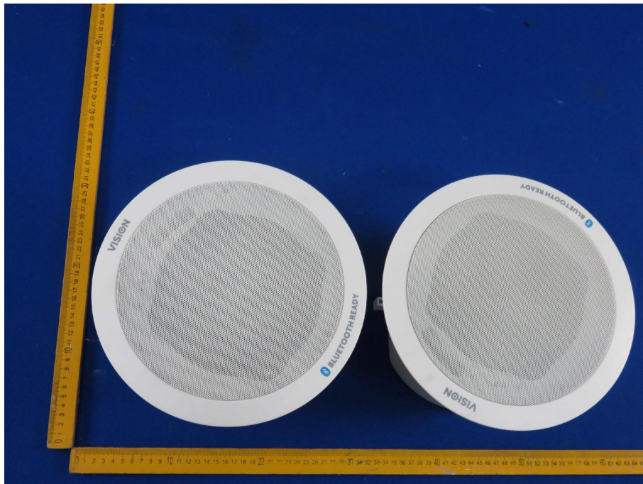
The EUT-Overall View