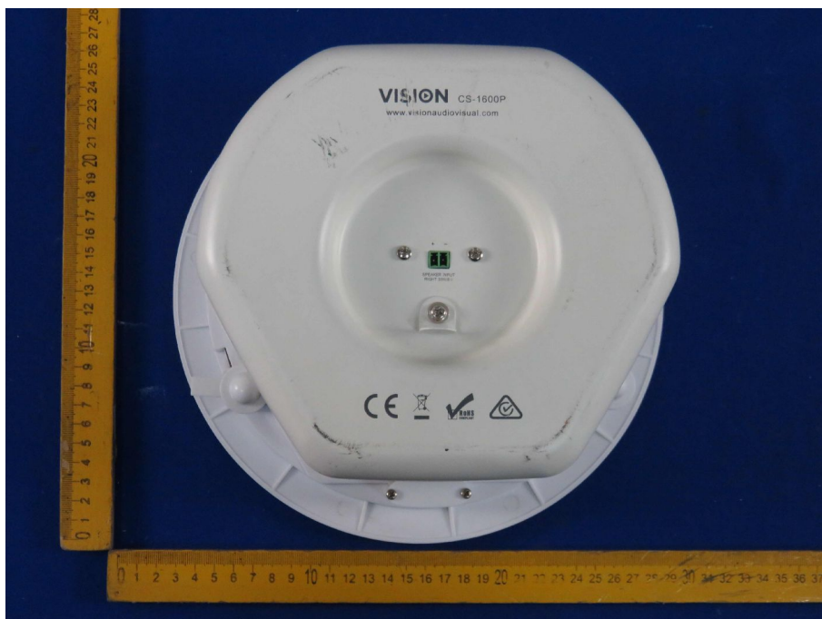
The EUT-Back View