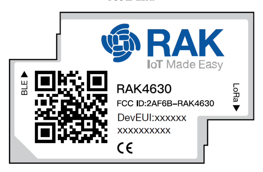
FCC ID Label Location Information