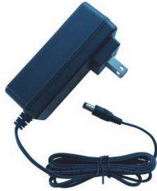
Power Cube (varies by country)