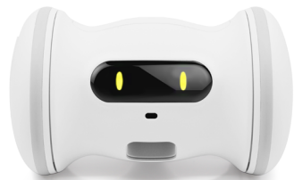
Pet Fitness Robot