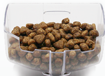
Additional Treat Box(Small)