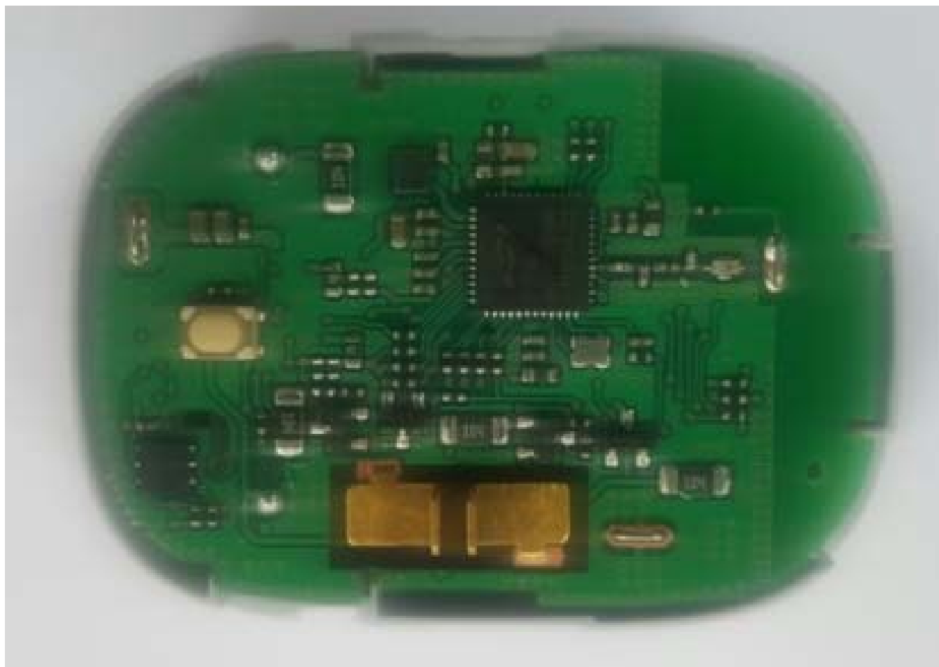
[ Inside View ]