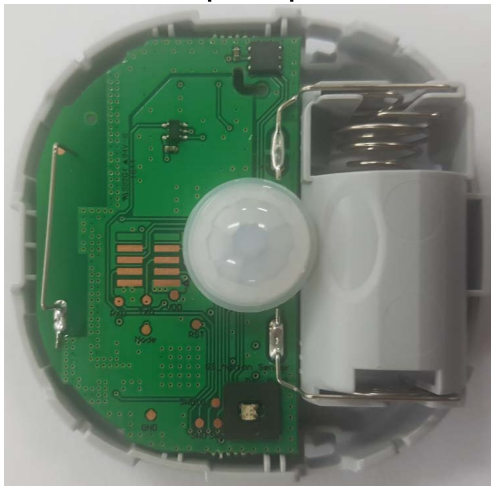
[ Inside View ]