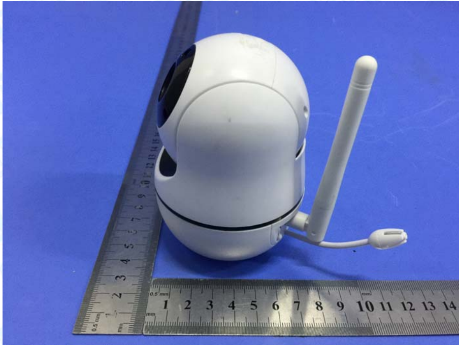
Photo 8 Appearance of EUT