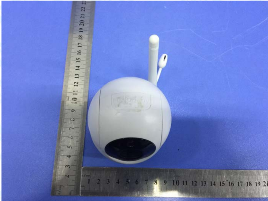
Photo 6 Appearance of EUT