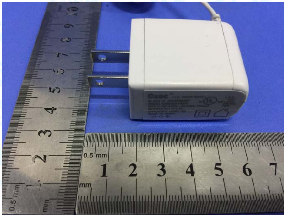
Photo 4 Appearance of EUT