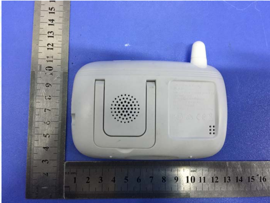
Photo 6 Appearance of EUT