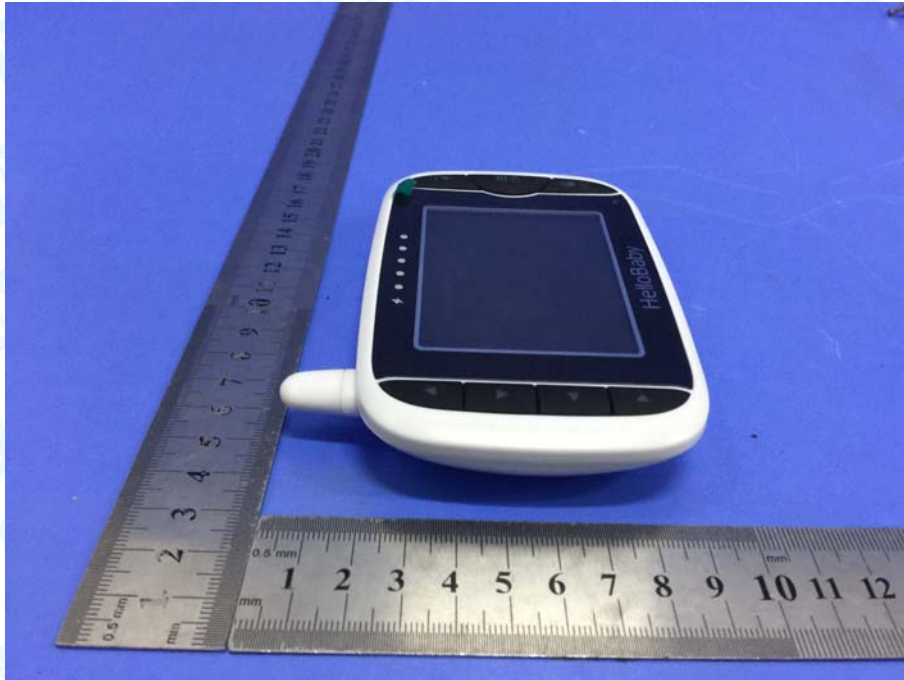
Photo 8 Appearance of EUT