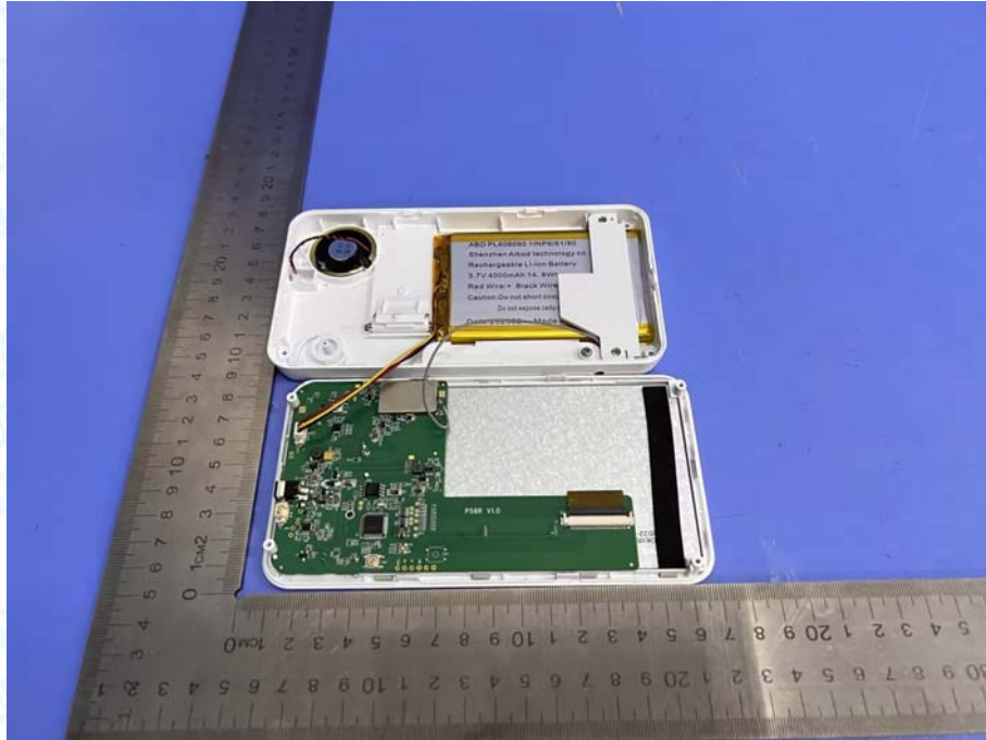
Photo 7 Internal of EUT