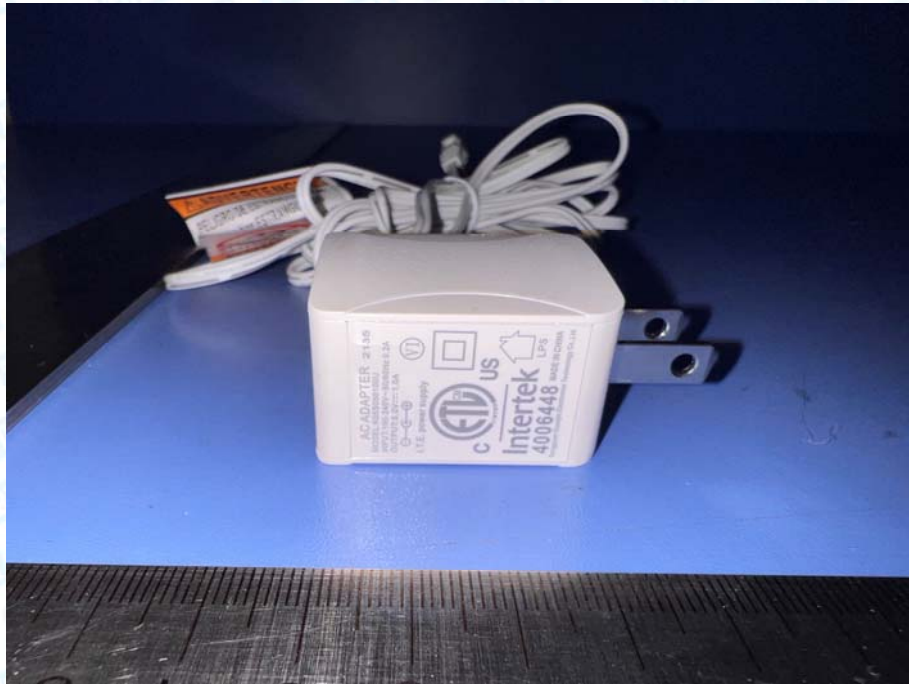
Photo 13 Appearance of Adapter