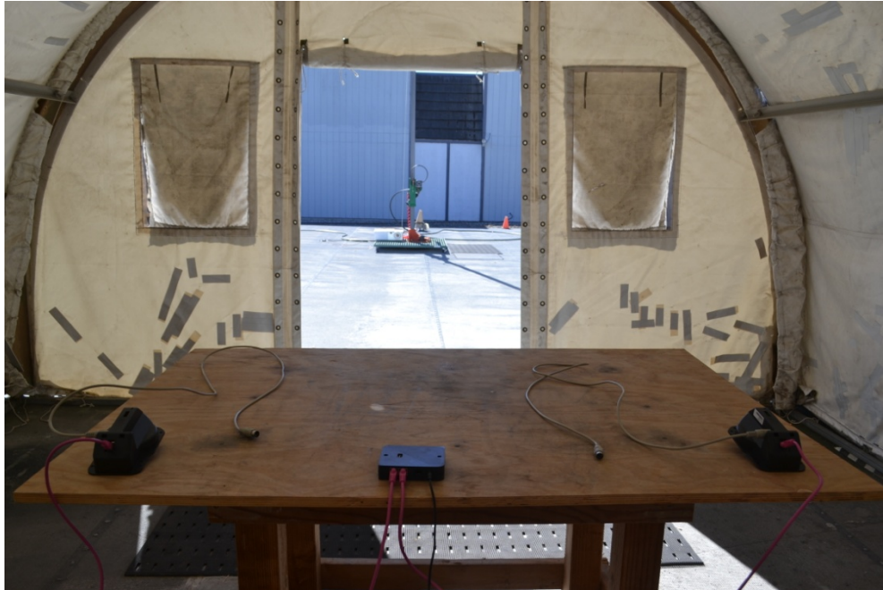
Radiated Emissions 9 KHz – 30 MHz