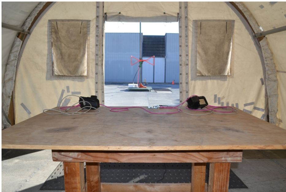
Radiated Emissions 30 MHz – 1 GHz