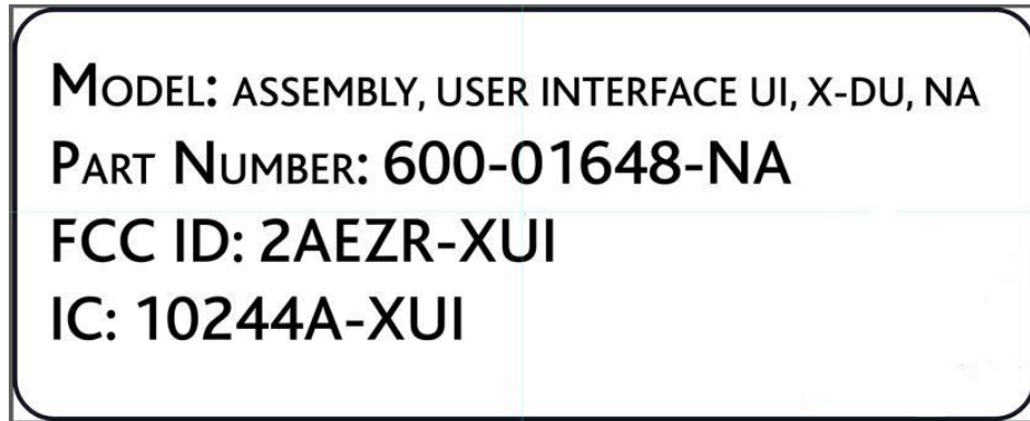
Figure 1 - Label