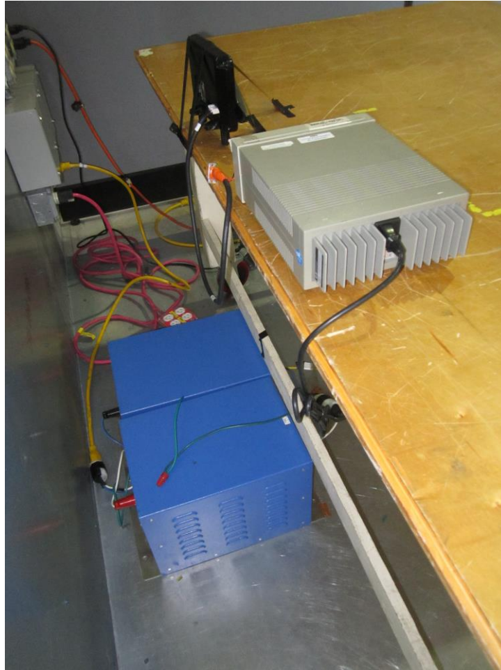
Conducted Emissions AC side of DC supply – Rear (0.15 to 30 MHz)