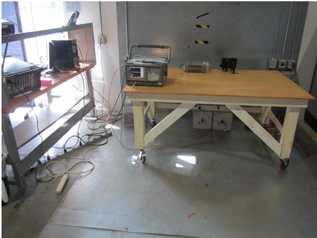
Conducted Emissions AC side of DC supply – Front (0.15 to 30 MHz)