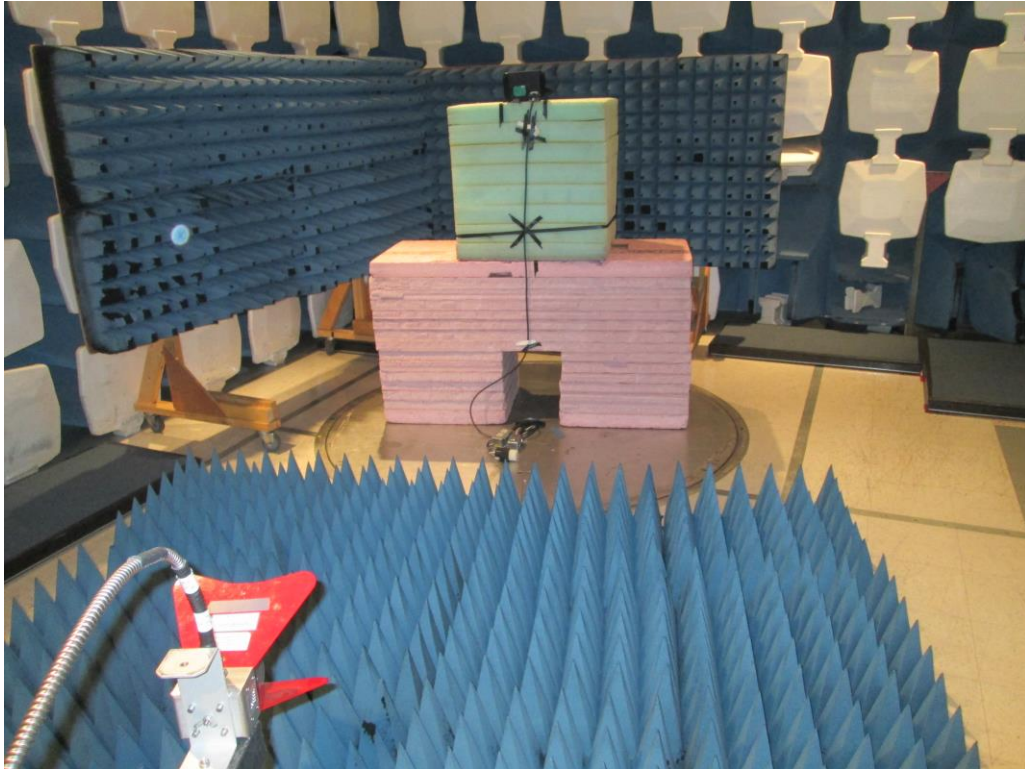
Radiated Emissions – 1 to 6 GHz