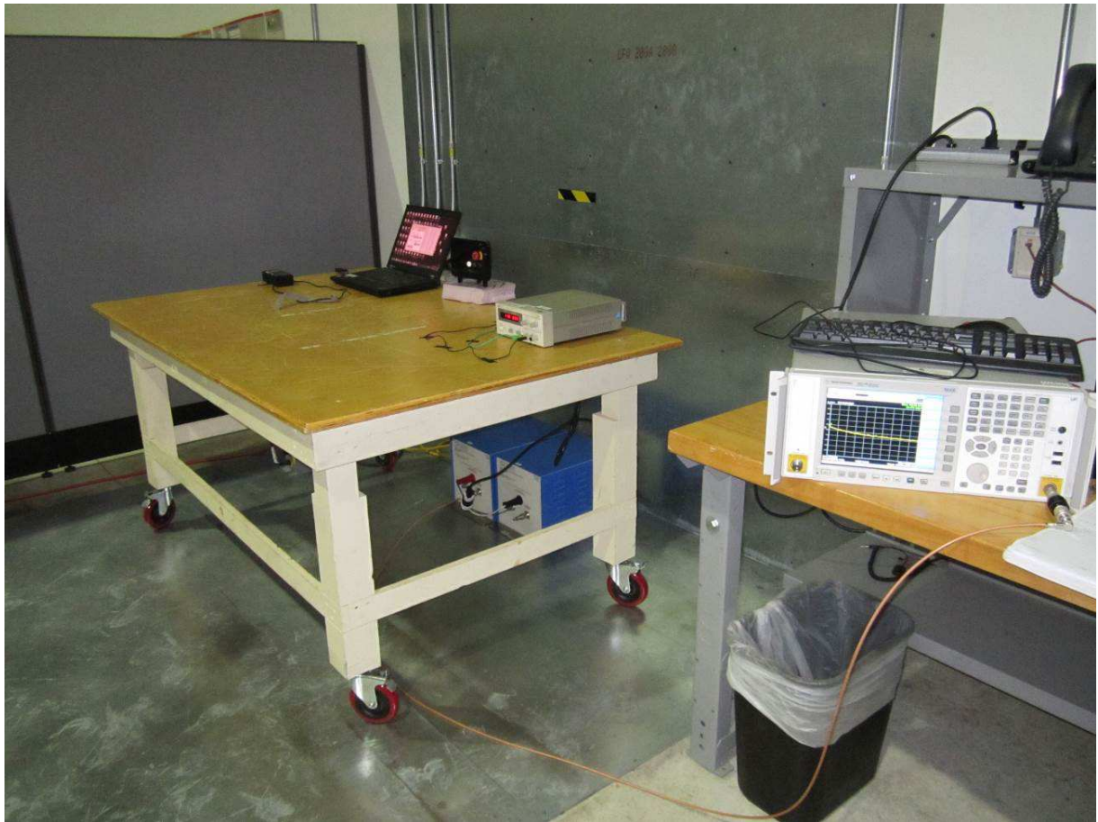
Conducted Emissions (0.15MHz-30MHz)