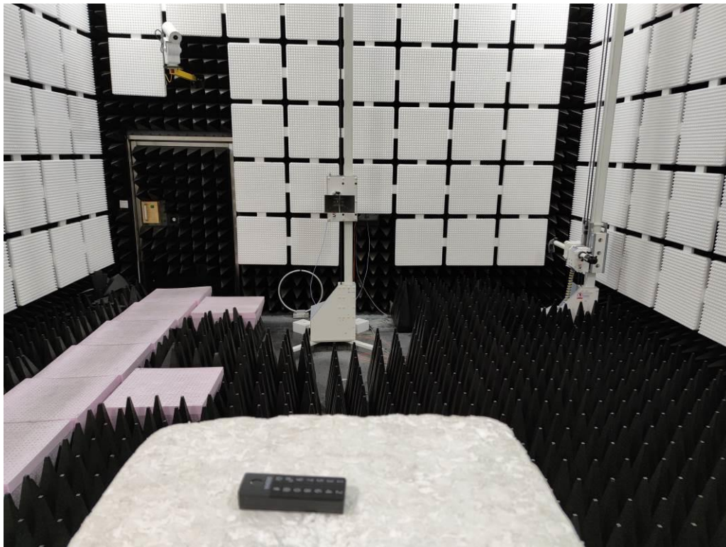
Above 1 GHz