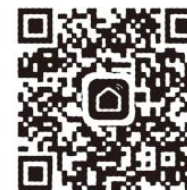
【Smart Life】 App