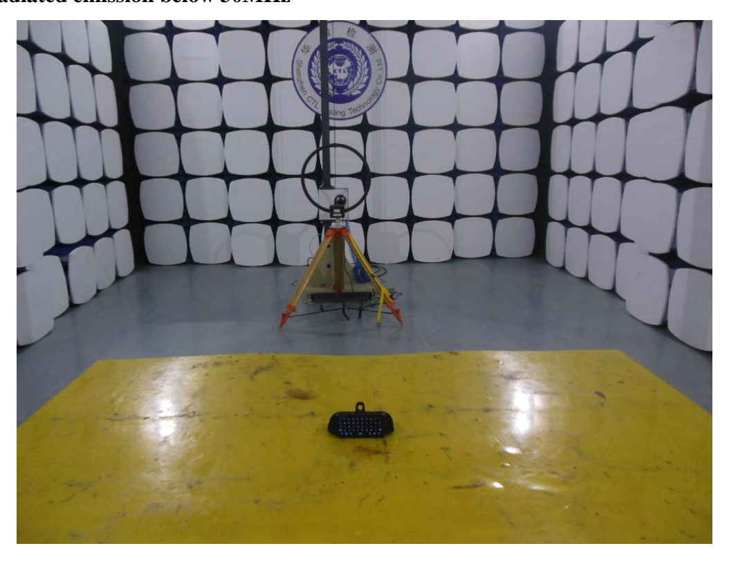
Radiated emission 30MHz~1GHz