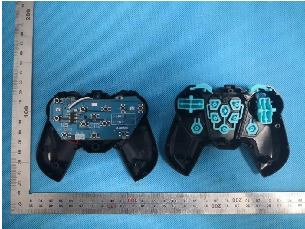
INTERNAL VIEW OF EUT (FIGURE 1)