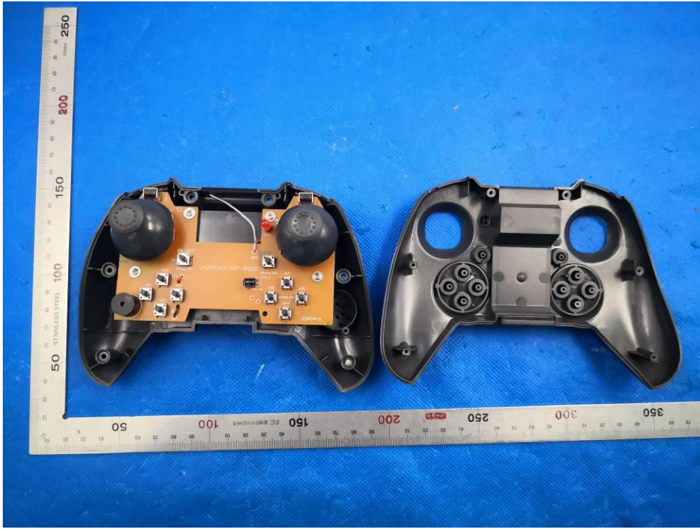
ANTENNA CLOSE-UP PHOTO-1