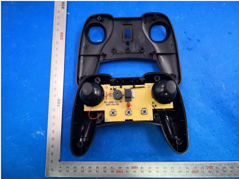
ANTENNA CLOSE-UP PHOTO-1