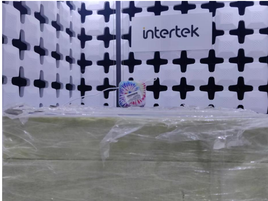
Back View (Above 1GHz)