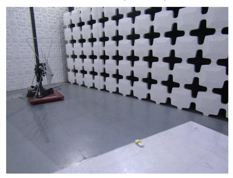
Radiated Emission (Above 1GHz)