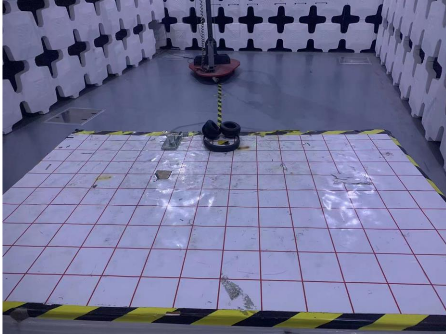
Back View (Below 1GHz)