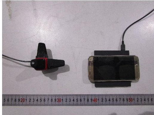
Probe Position Rear