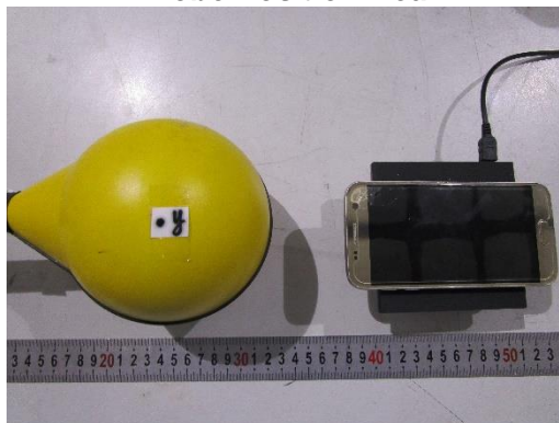
Probe Position Rear