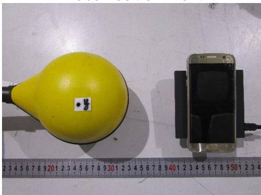
Probe Position Front