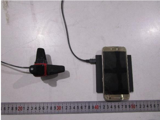
Probe Position Left