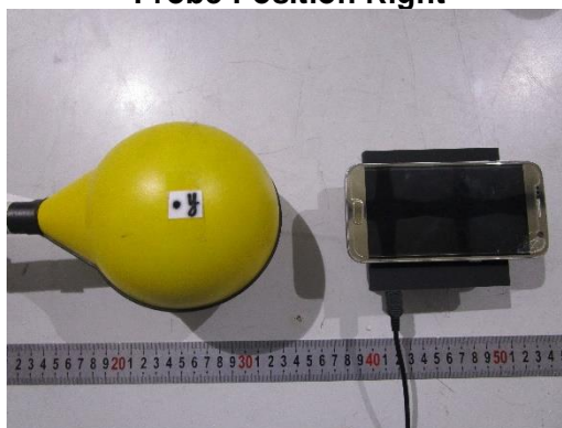
Probe Position Right