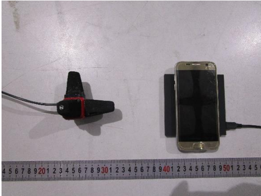
Probe Position Front