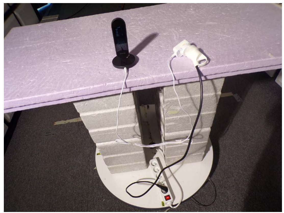
Test setup for radiated emission below 1GHz