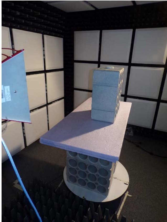
Radiated emission above 1GHz