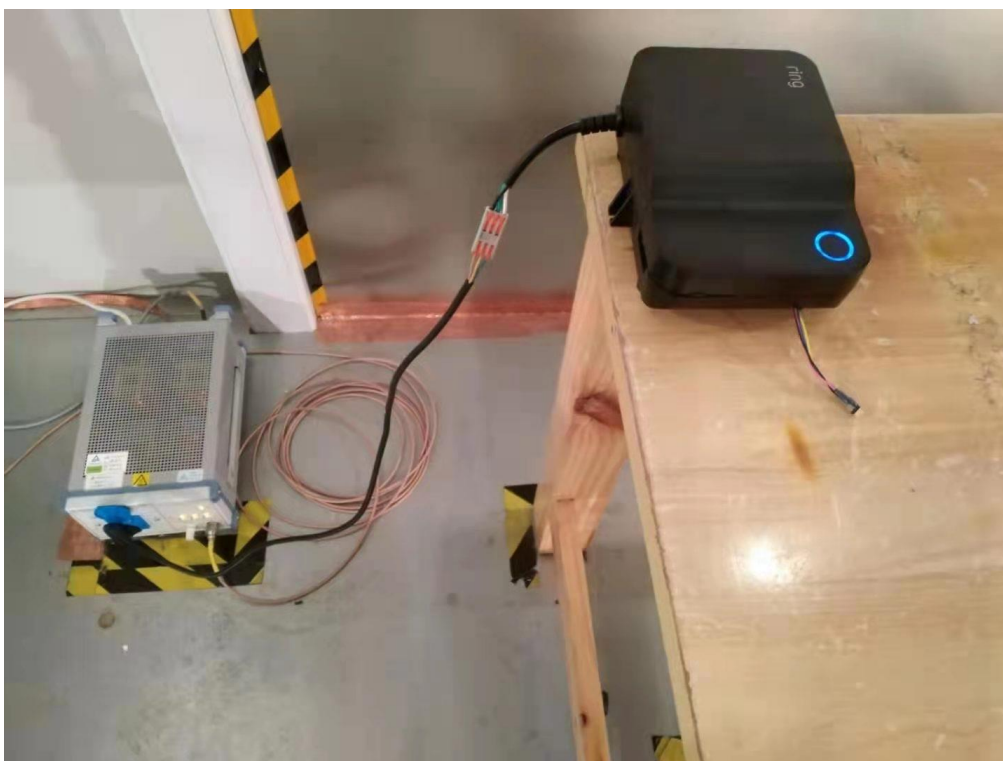
Set-up for Conducted Emission