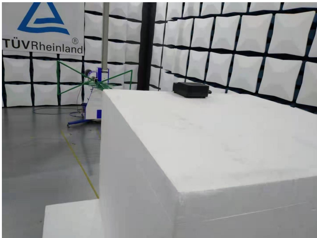
Set-up for Radiated Emission Below 1GHz