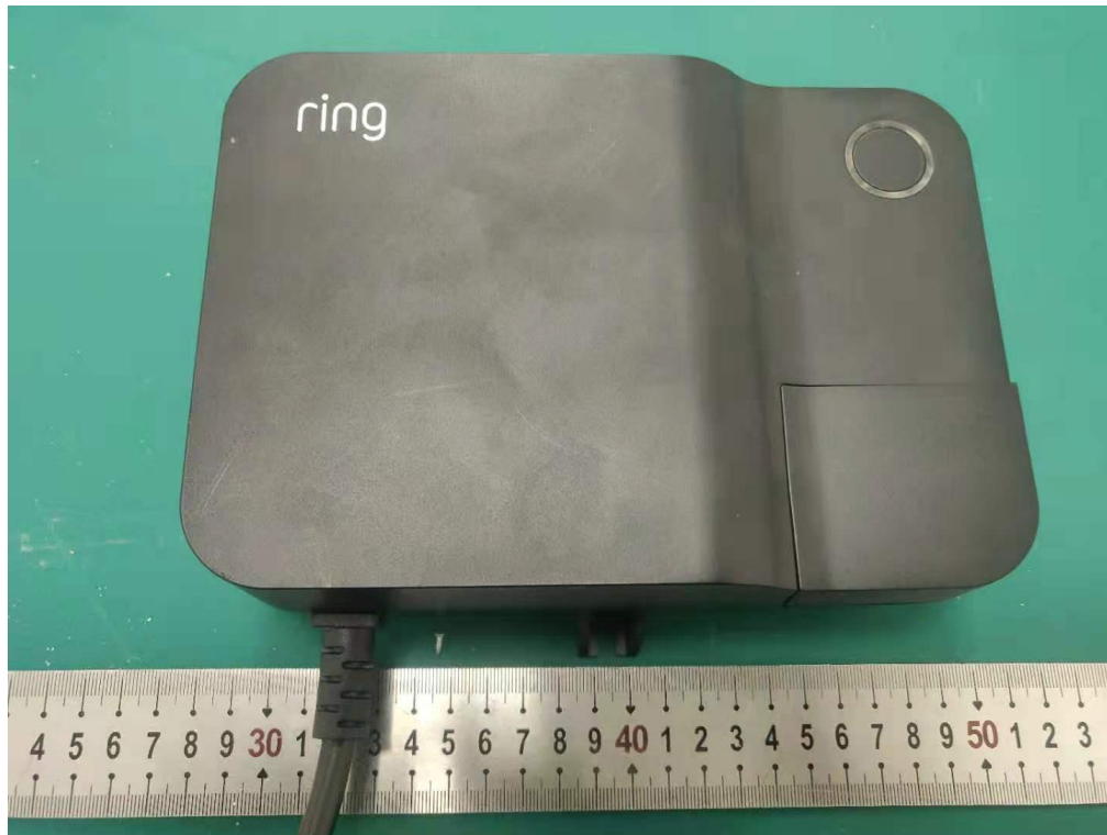
Type designation: 5AT1S9