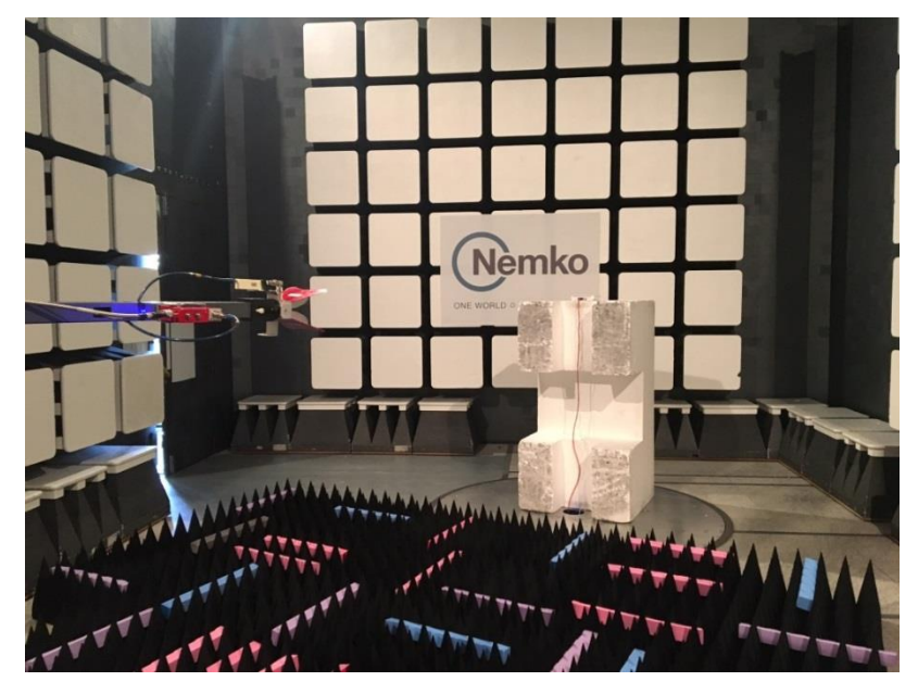
Figure 1.1-4: Radiated emissions setup photo – above 1 GHz