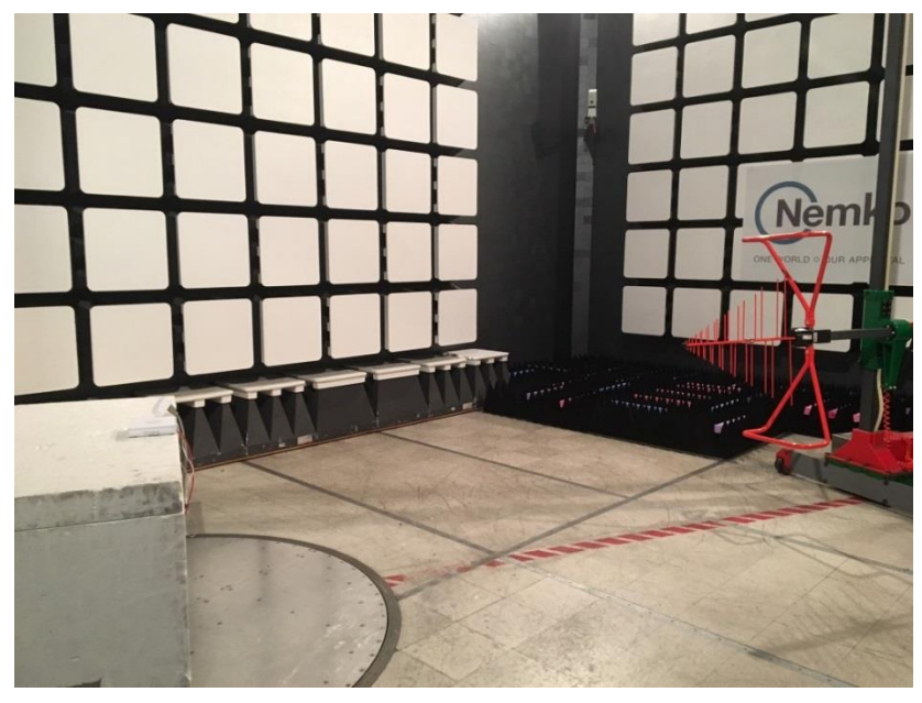
Figure 1.1-2: Radiated emissions setup photo – below 1 GHz