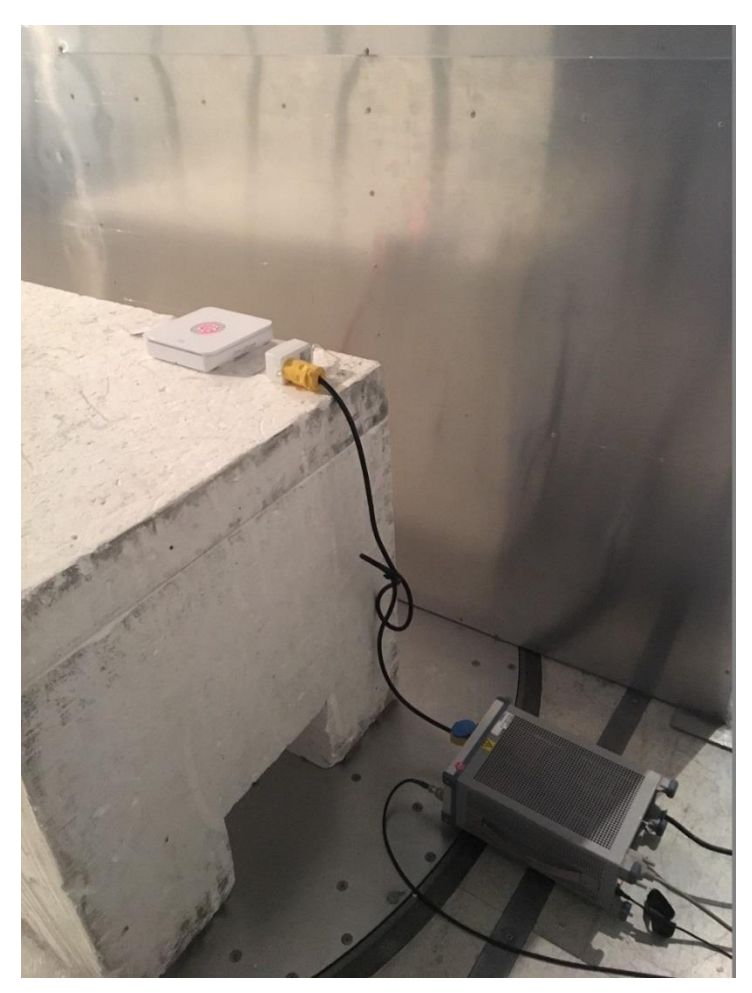
Figure 1.2-1: AC power line conducted emissions – setup photo