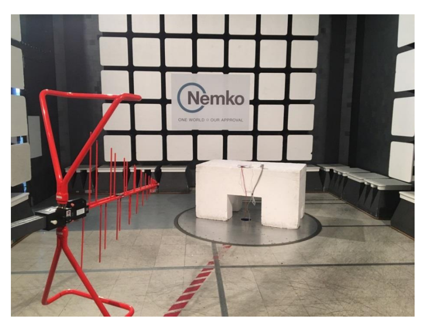
Figure 1.1-1: Radiated emissions setup photo – below 1 GHz