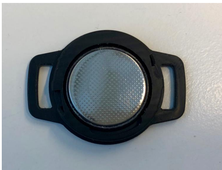
Battery correctly in place