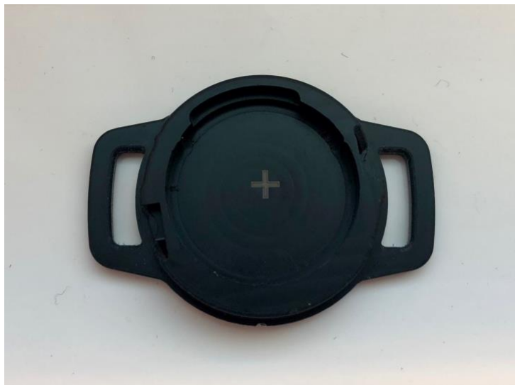
Set battery positive pole towards the positive mark

Set one CR2032 (LR44) battery to the battery lid so that battery's negative pole is facing upwards and positive pole facing towards battery lid. Close battery lid by twisting it clockwise from marked starting position to marked close position. Battery lid can be attached only from this one position. Ensure battery lid is tightly closed to maintain waterproofness.