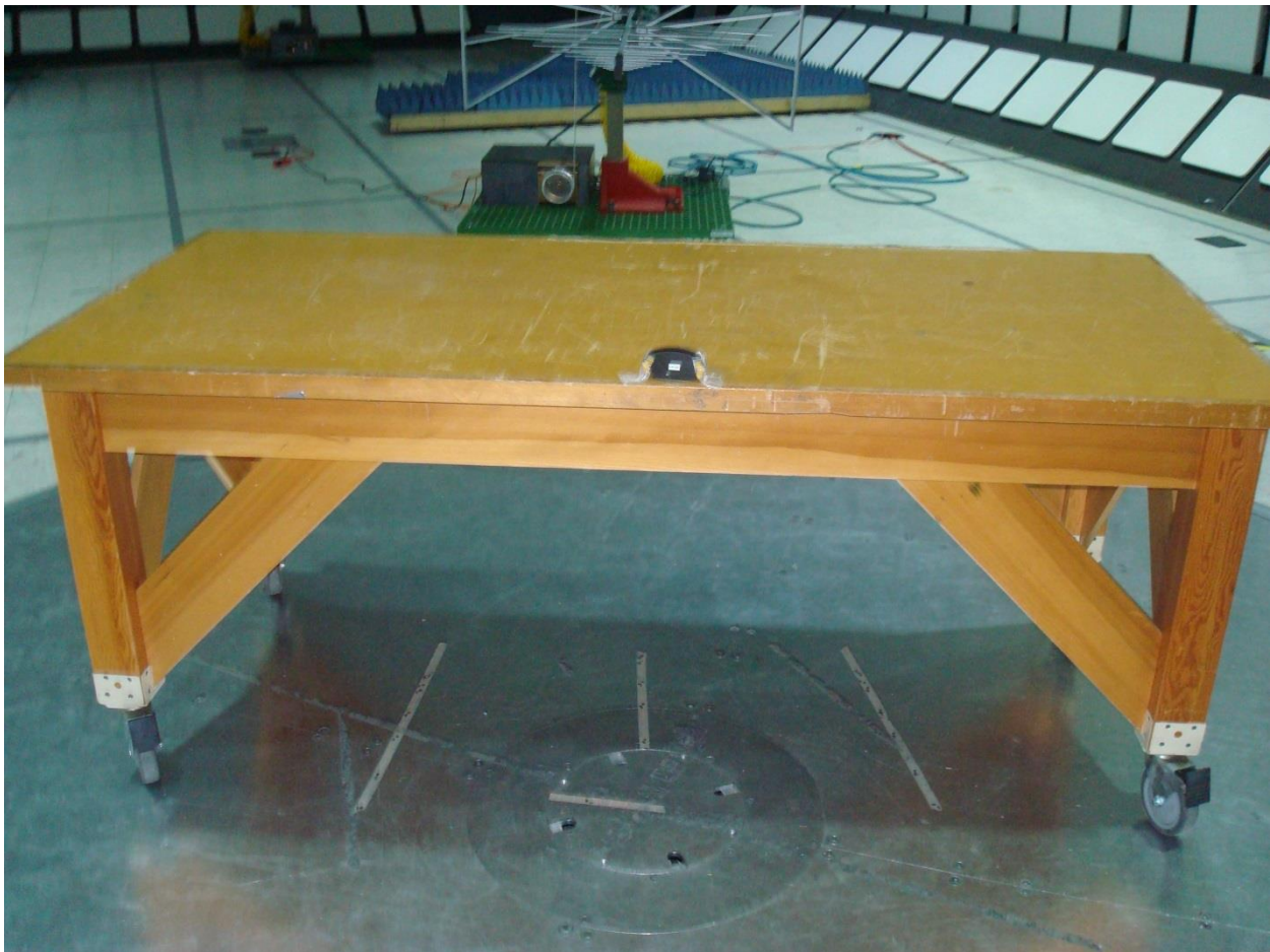
Test setup for 30 MHz – 1 GHz, bandwidth, band-edge and duty cycle