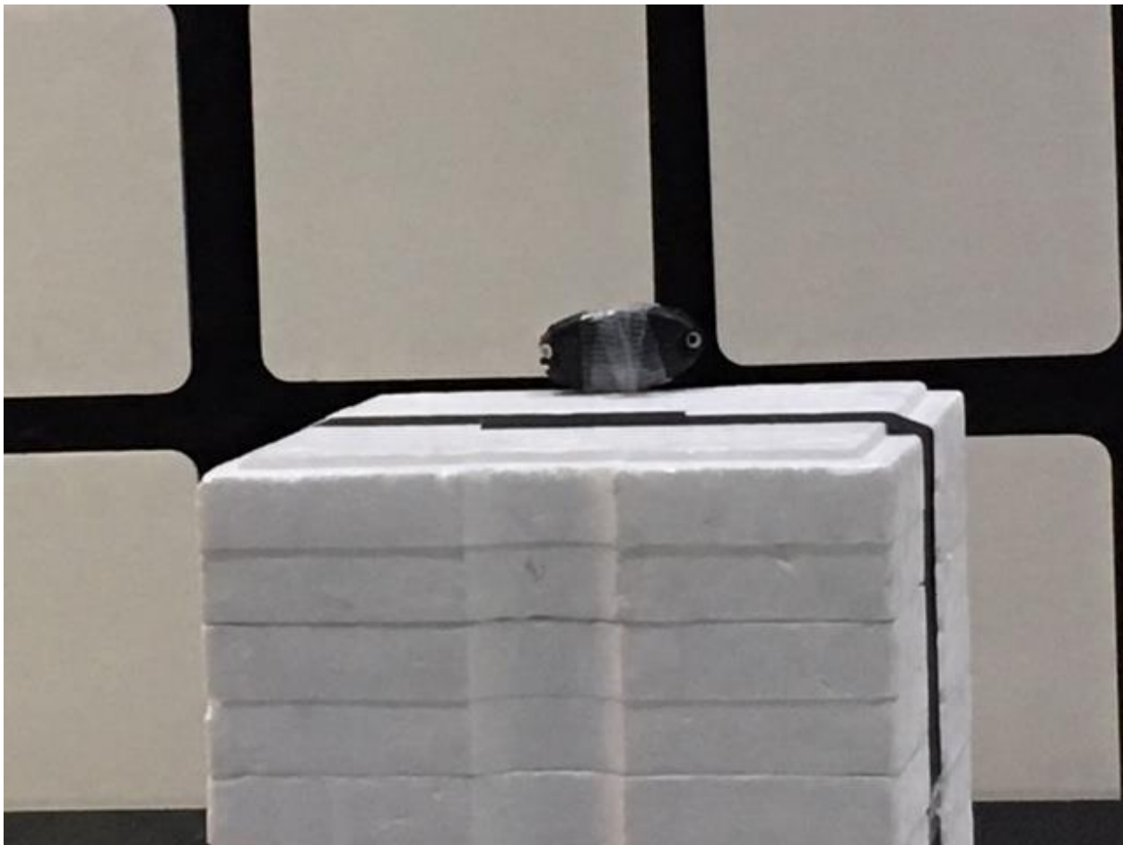
X-axis (worse-case, used for testing)