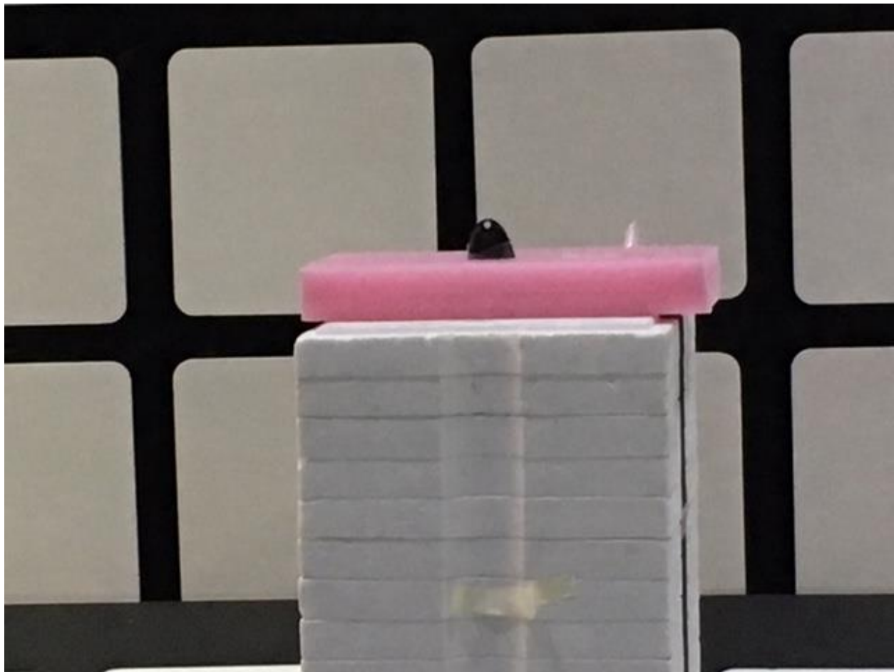
Y-axis (investigated only)