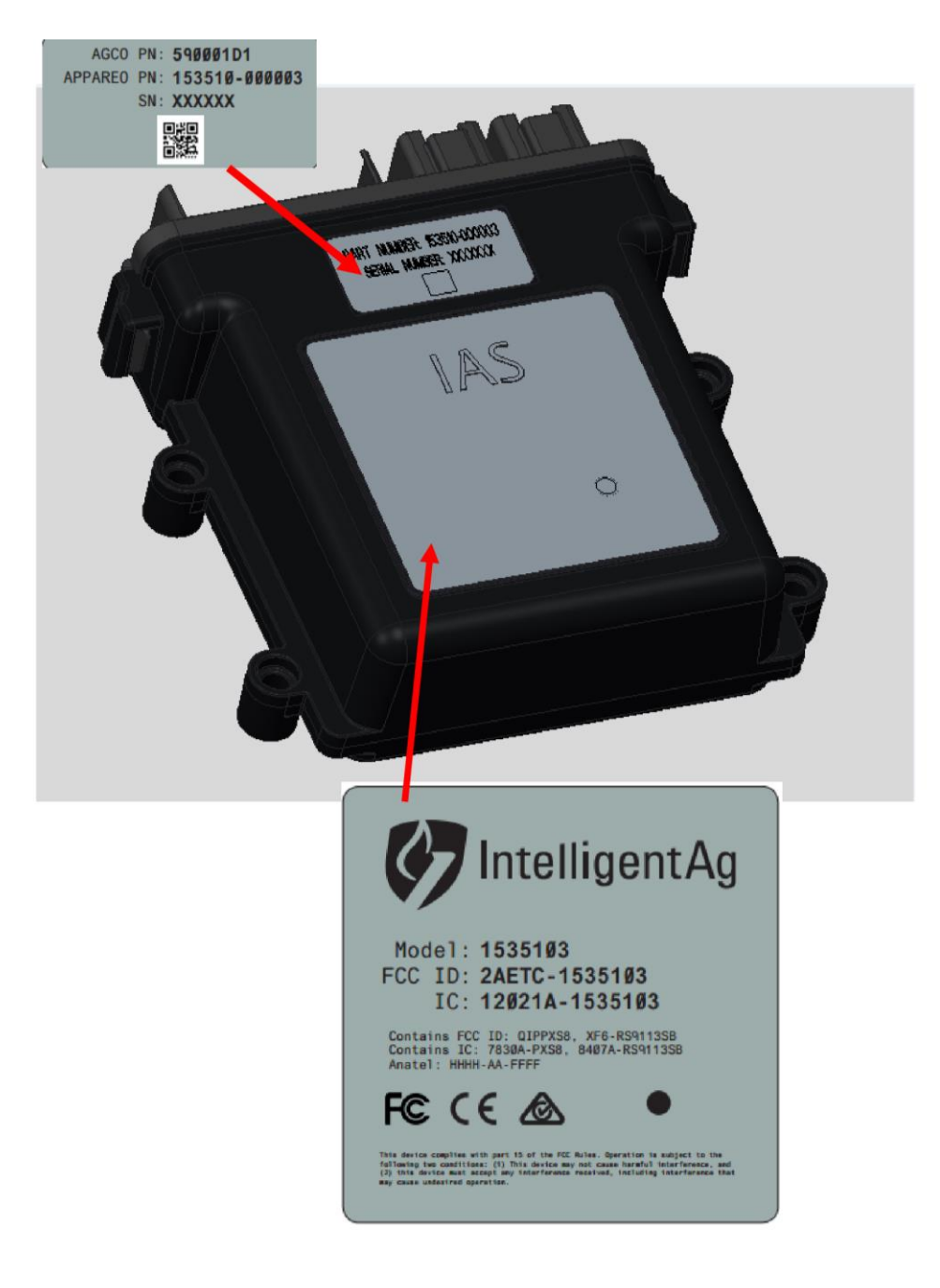
Figure 1 - Label location – Label is plastic with screen-printing

Applicant: Appareo Systems, LLC Model Name: 1535103