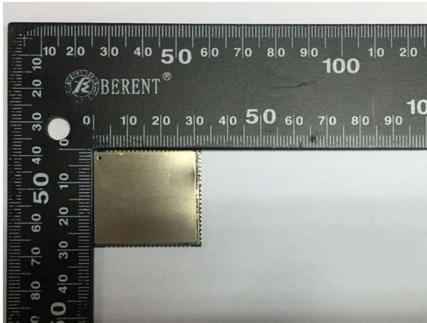
EUT – Bottom View(EC25-A)