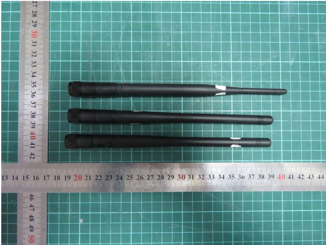
LTE Antenna/ WiFi Antenna b:Antenna Picture 1 EUT and Accessory