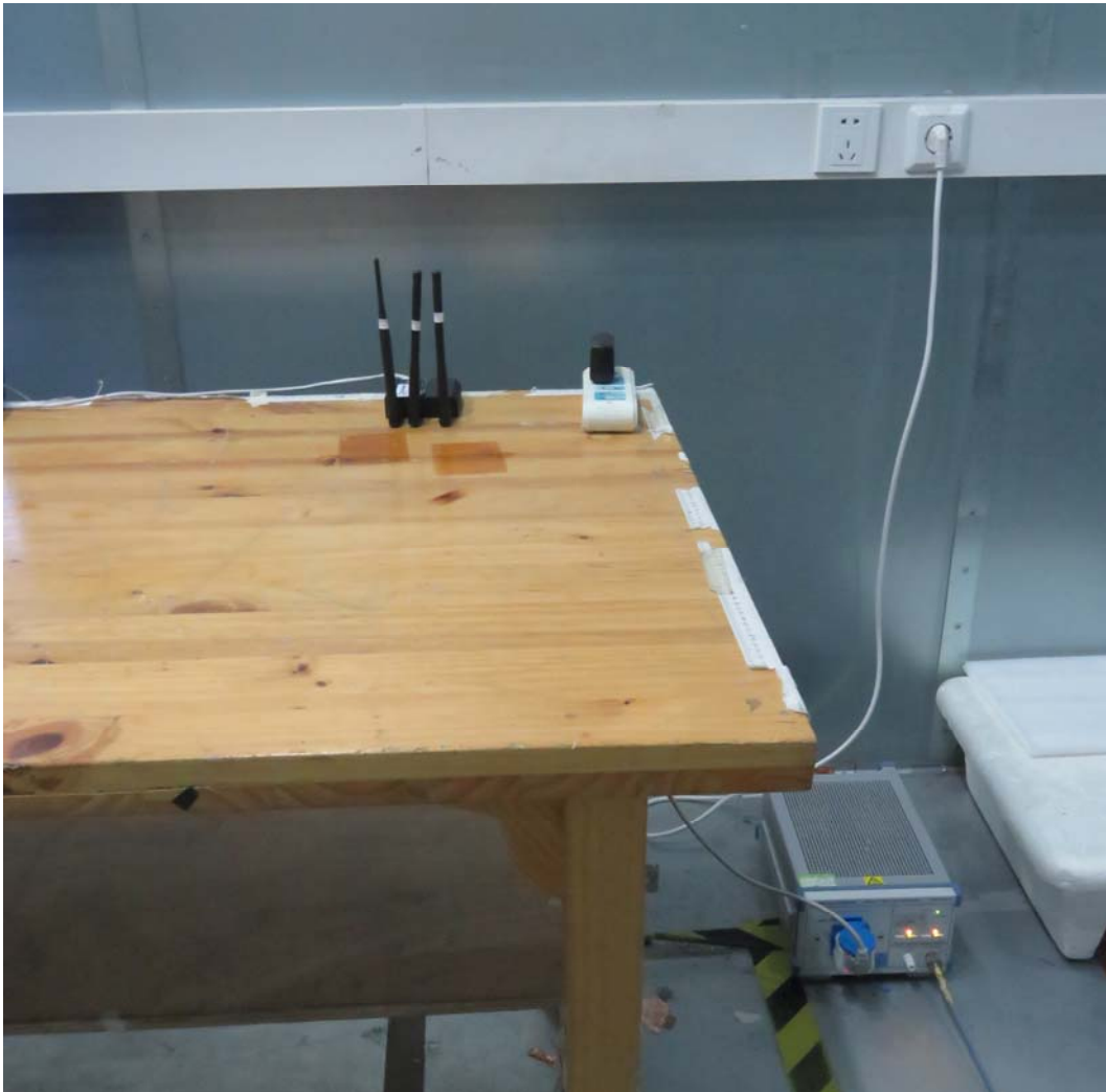
Picture 3 Conducted Emission Test Setup