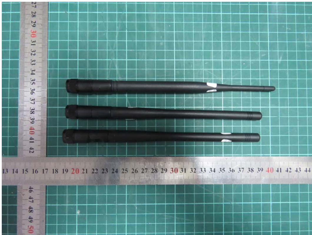
LTE Antenna/ WiFi Antenna b:Antenna Picture 1 EUT and Accessory