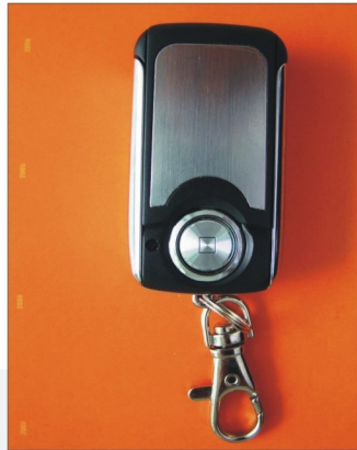
Fig.2 Remote Control Handle