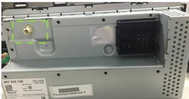
With AM/FM, Without DAB Function