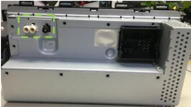
With AM/FM, With DAB Function