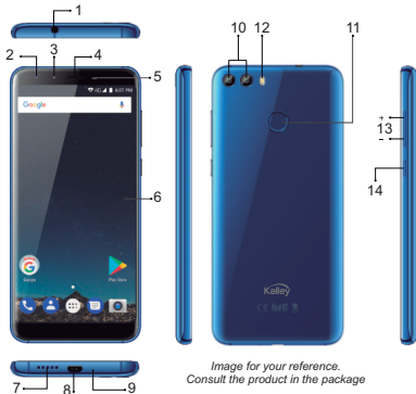
Image for your reference. Consult the product in the package