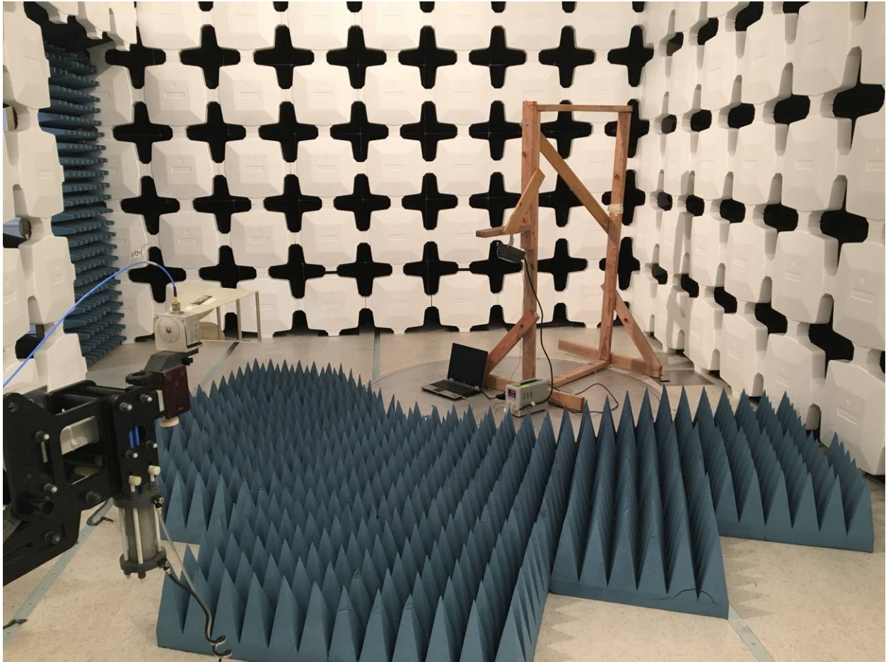
Figure 5. Radiated Emission Test Setup, above 1 GHz, Single Config