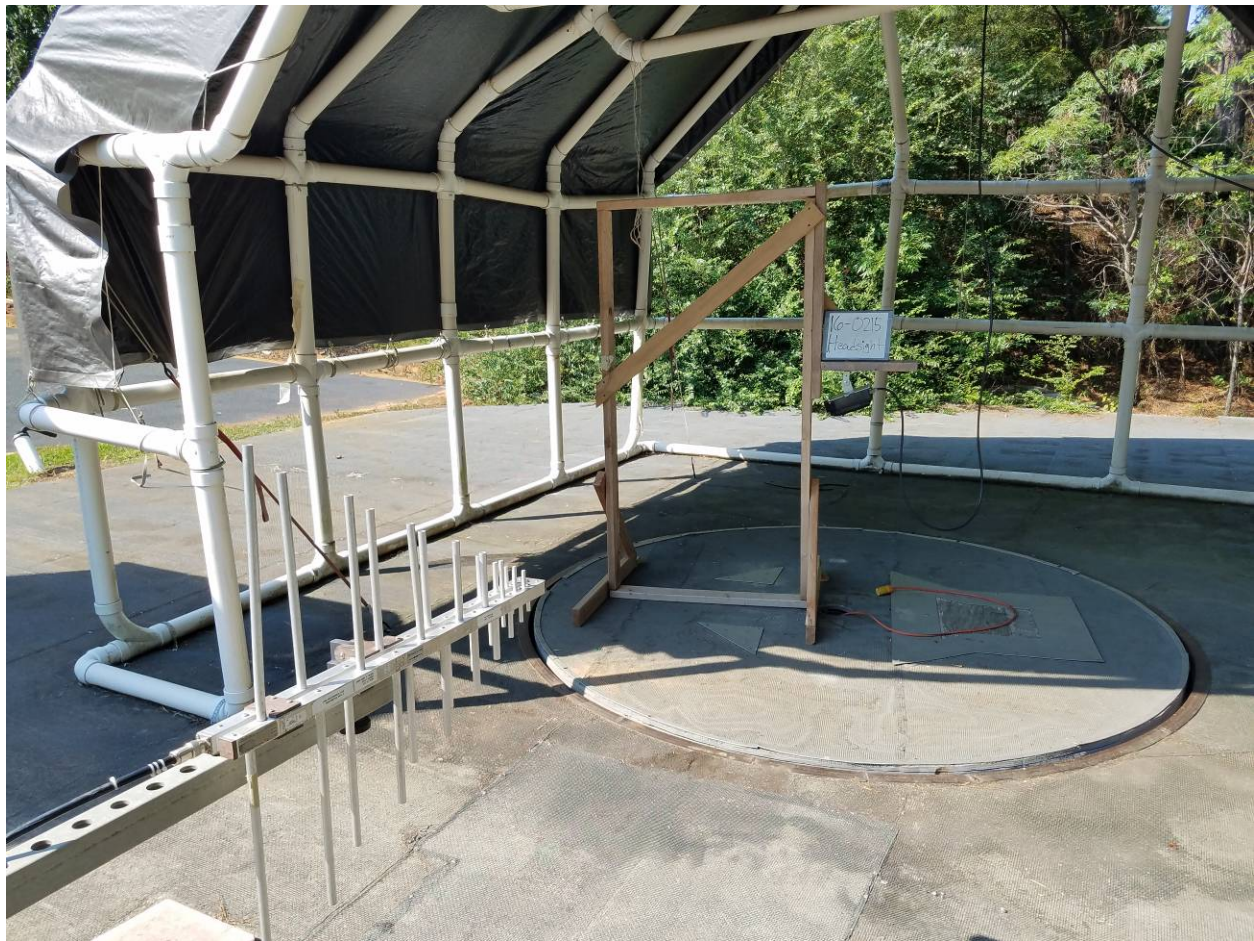
Figure 3. Radiated Emissions Test Setup, 200 MHz to 1GHz, Single Config

FCC Part 15 Certification/ RSS 220 2AEP2-THAWK1 17-0097 June 13, 2017 Headsight, Inc. HT5200