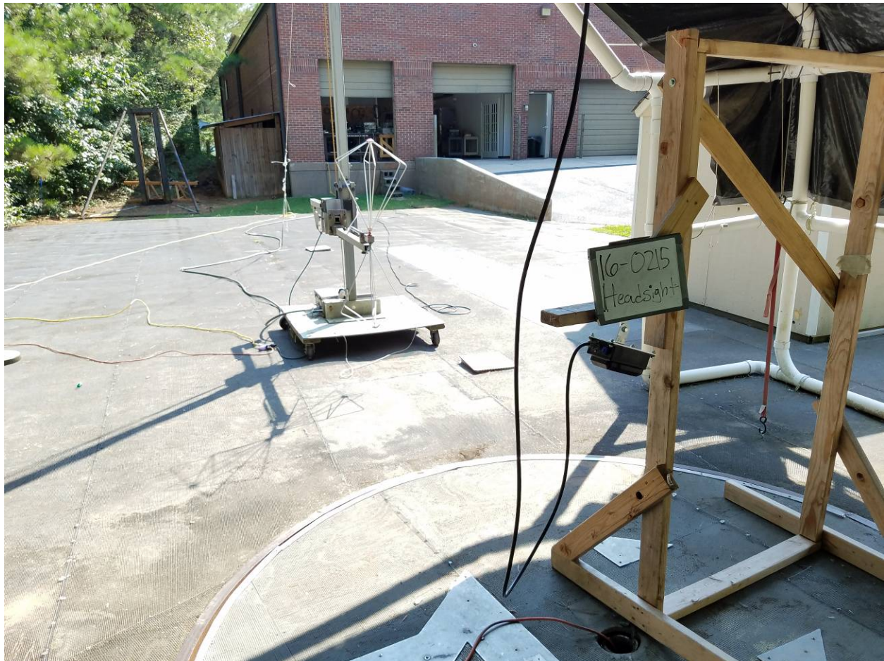
Figure 1. Radiated Emissions Test Setup, 30 MHz to 200 MHz, Single Config

Note: 16-0215 is project number for testing performed in 2016