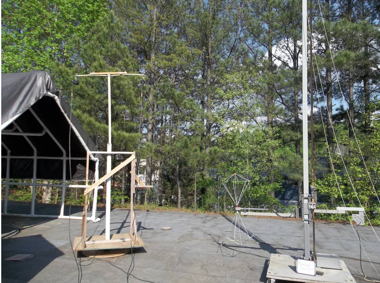
Figure 2. Radiated Emissions Test Setup, 30 MHz to 200 MHz, Dual Config