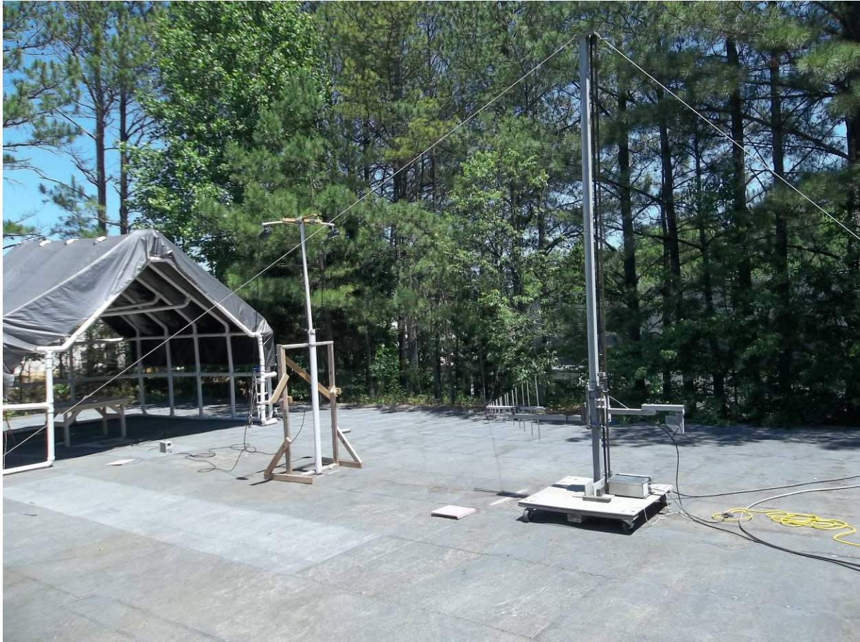
Figure 4. Radiated Emissions Test Setup, 200 MHz to 1GHz, Dual Config

FCC Part 15 Certification/ RSS 220 2AEP2-THAWK1 17-0097 June 13, 2017 Headsight, Inc. HT5200