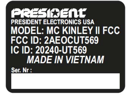
Figure E13.1 - Label Sample