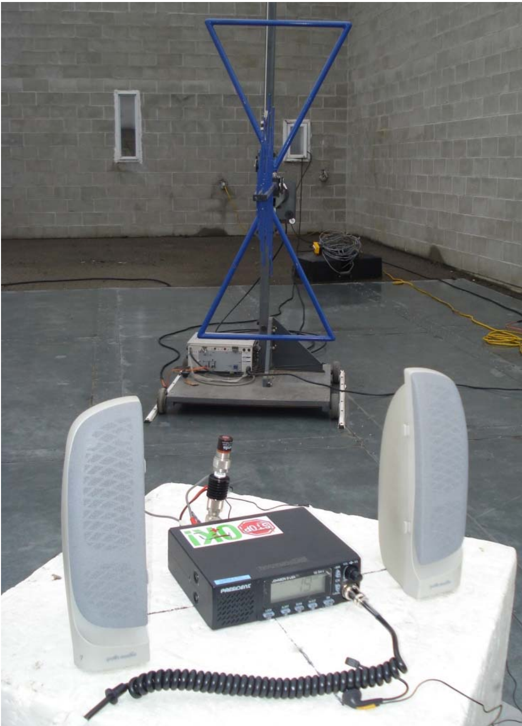
Figure 2 – Radiated Emissions