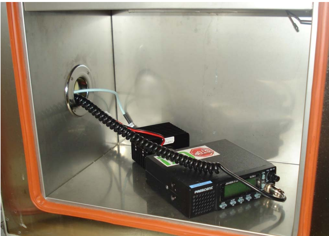
Figure 4 – Frequency Stability