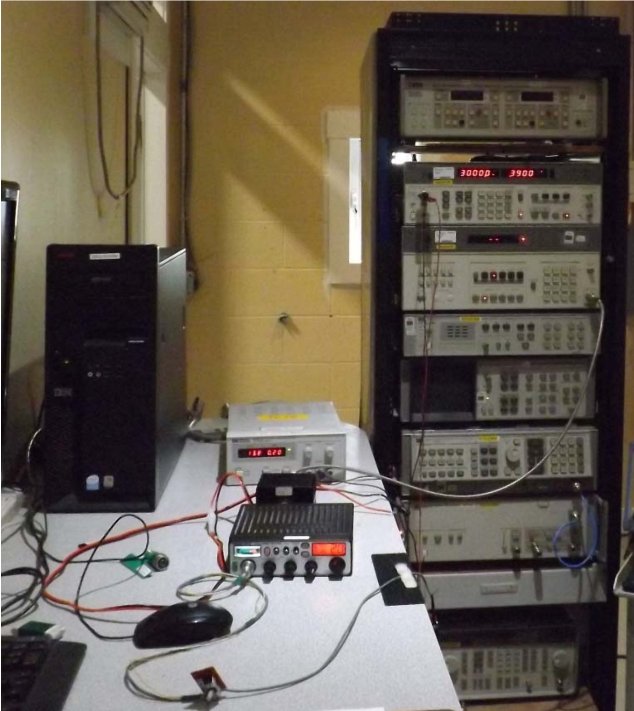
Figure E17.1 – Setup, Modulation Response