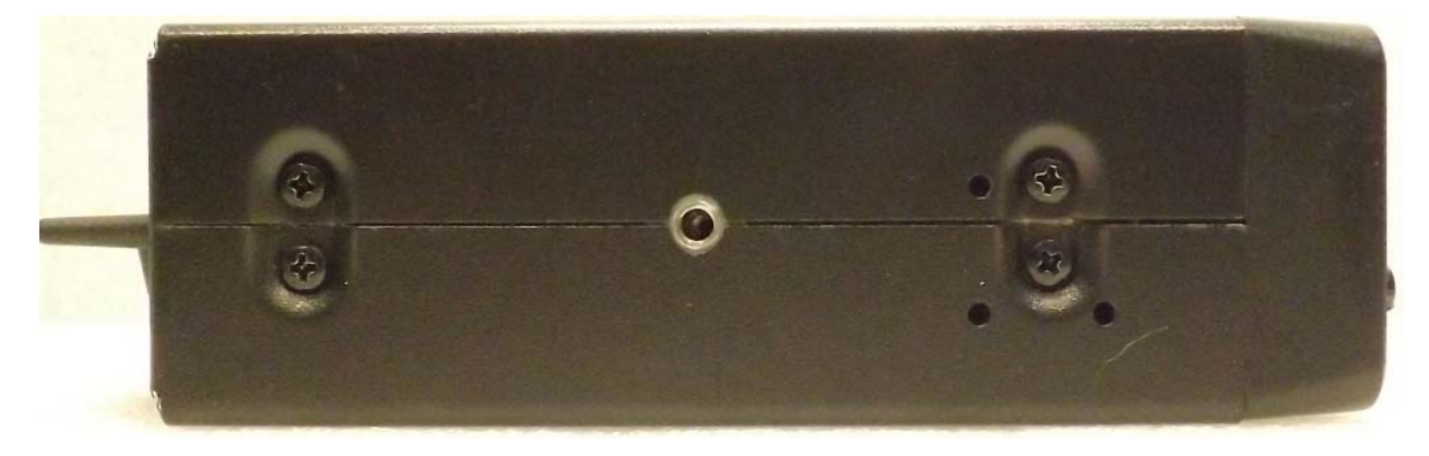
Figure E15.4 – External, Right