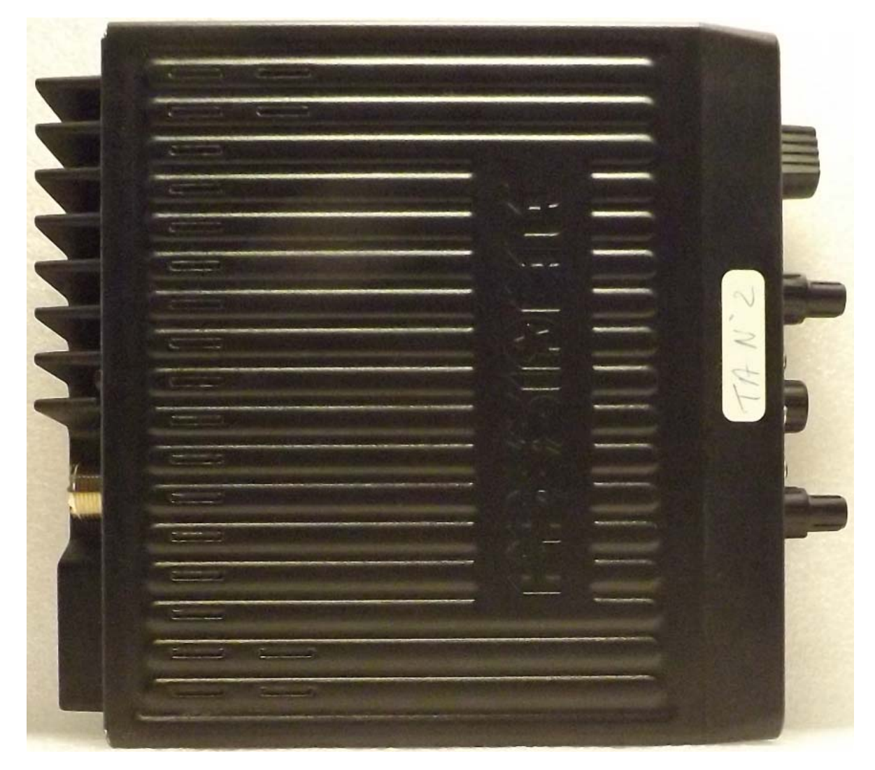
Figure E15.5 – External, Top