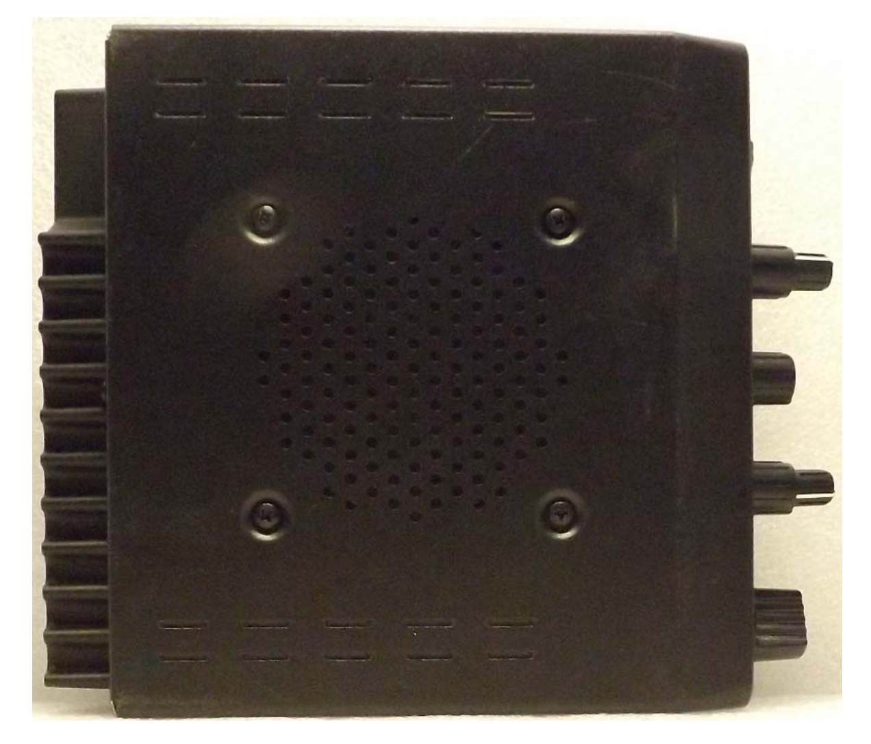
Figure E15.6 – External, Bottom