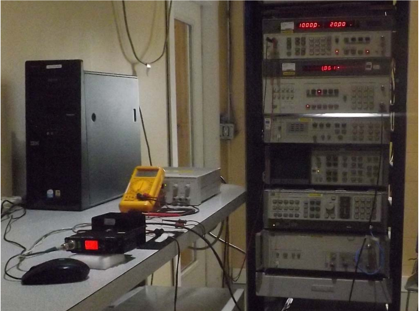
Figure E17.1 – Setup, Modulation Response